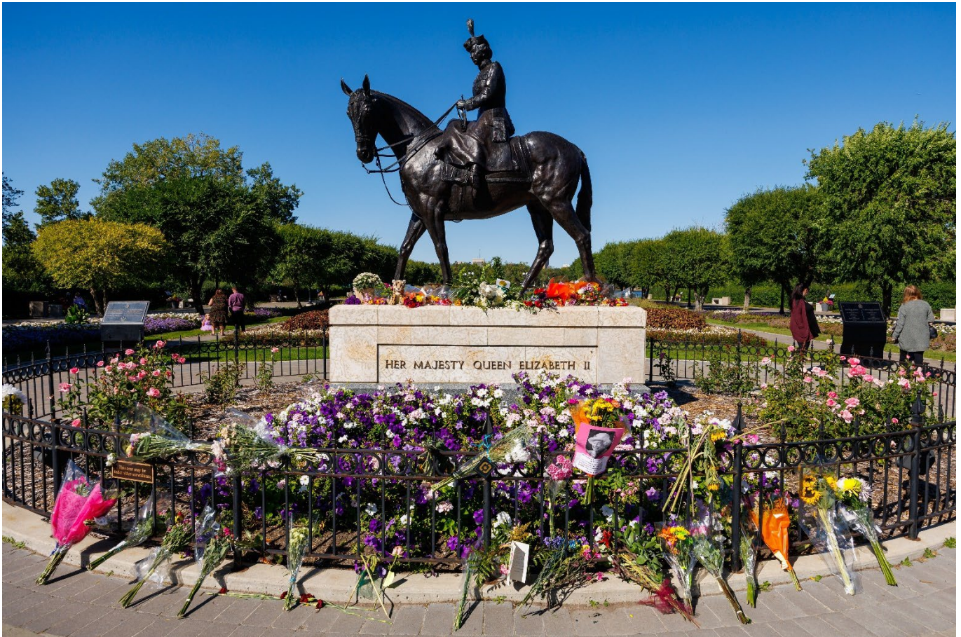
Flowers in memory of Her Majesty Queen Elizabeth II, Regina, September 2022