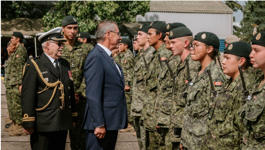
August 11, 2022 Bold Eagle Graduation Wainwright